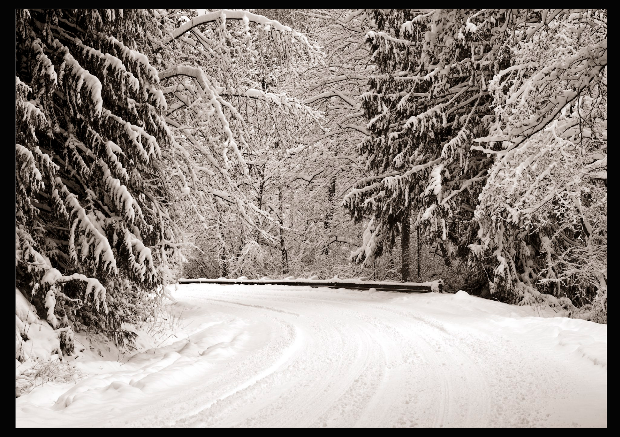
The Road to Mount Erie, in the Silence after the Storm, 2008