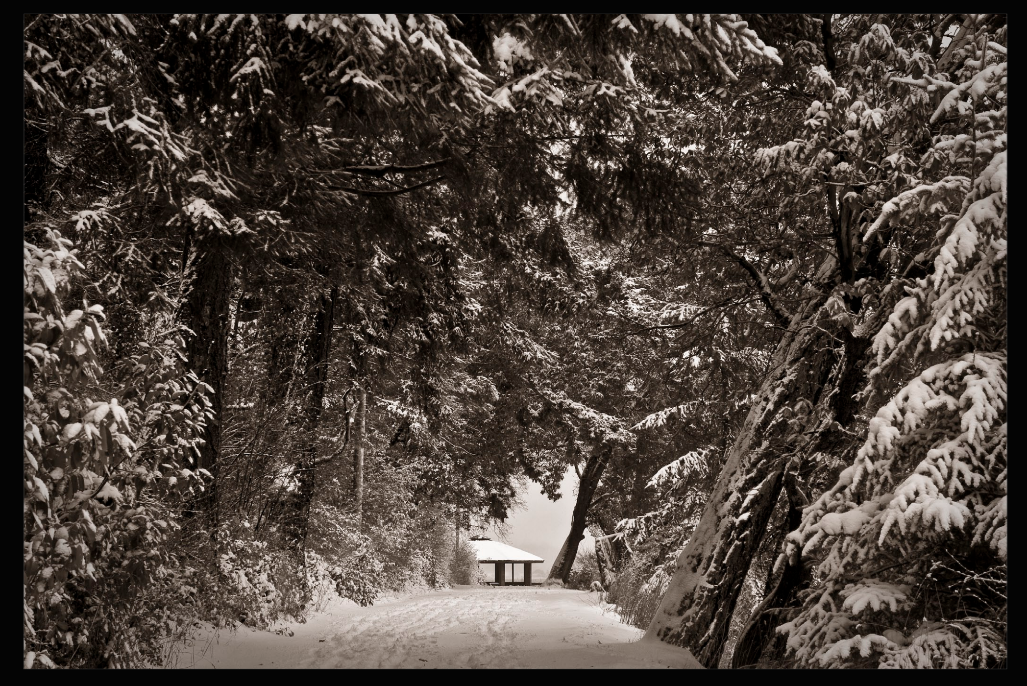
Tunnel to the Cupola, Fidalgo Bay, 2008