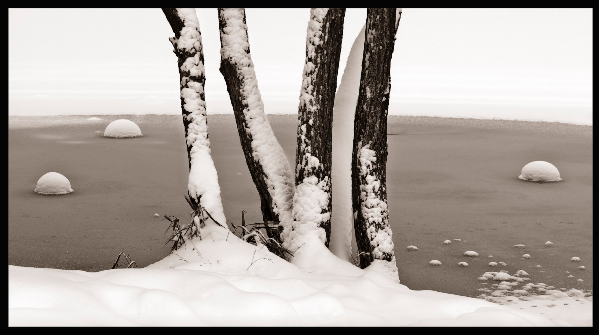
Winter Siblings, 2008