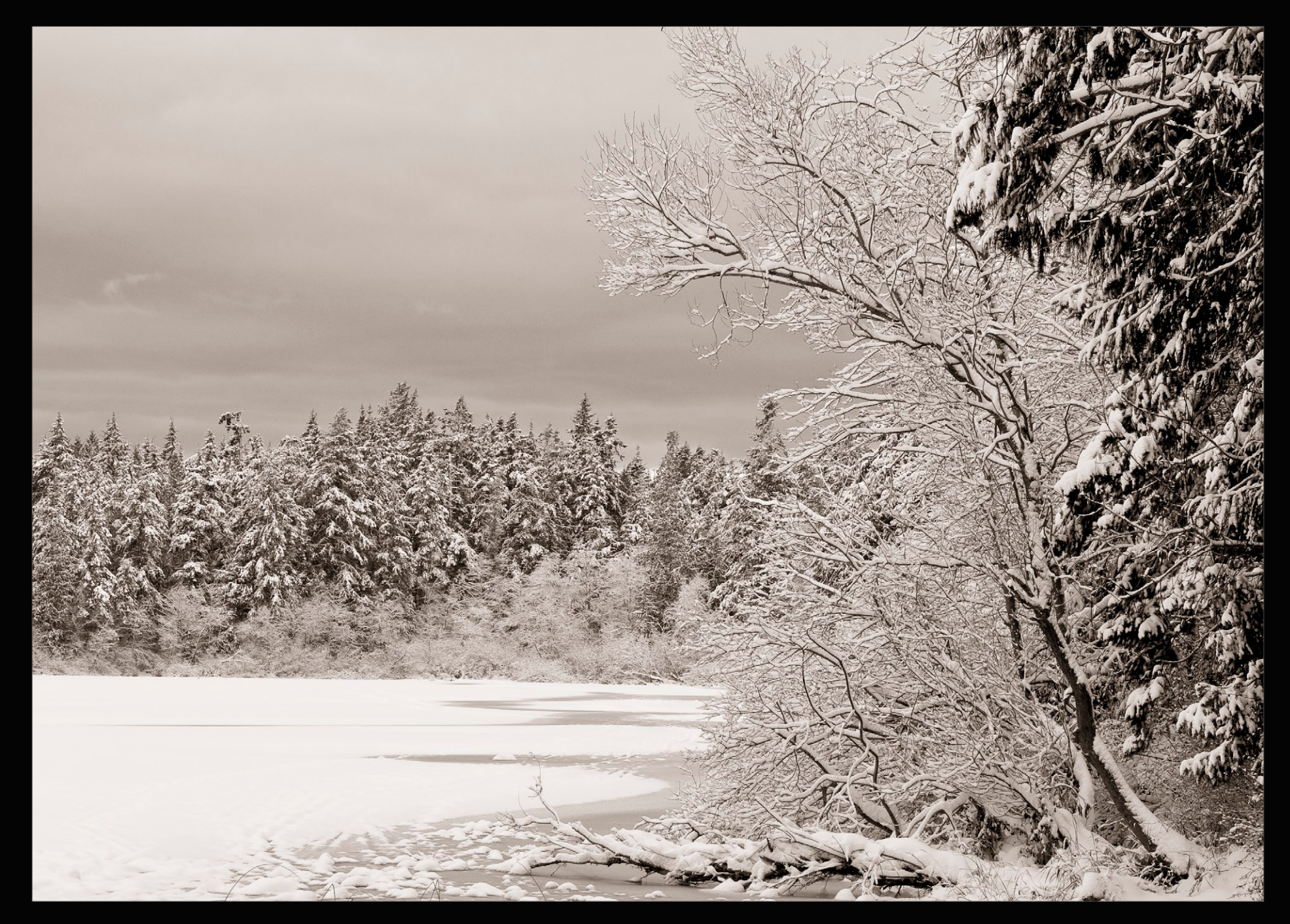
The Long Winters of Ryōkan, 2008