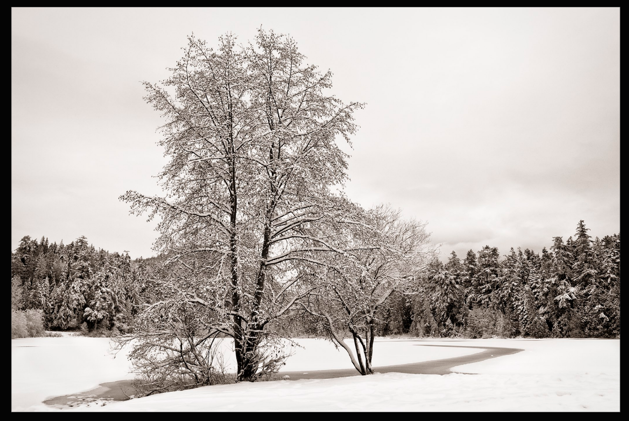
Heart Lake, 2008